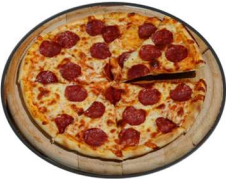
Pizza Night January 21, 2026 Join us before Bible Class at 6pm Fellowship and Pizza